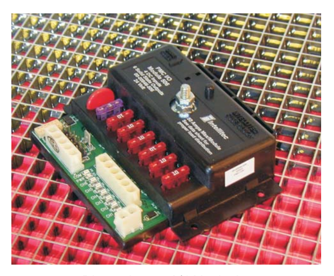
Dimensions 5-3/4 X 5 inches Pat. No. 4,907,222 & 6,011,997

This module should be installed in a protected environment, inside a vehicle.