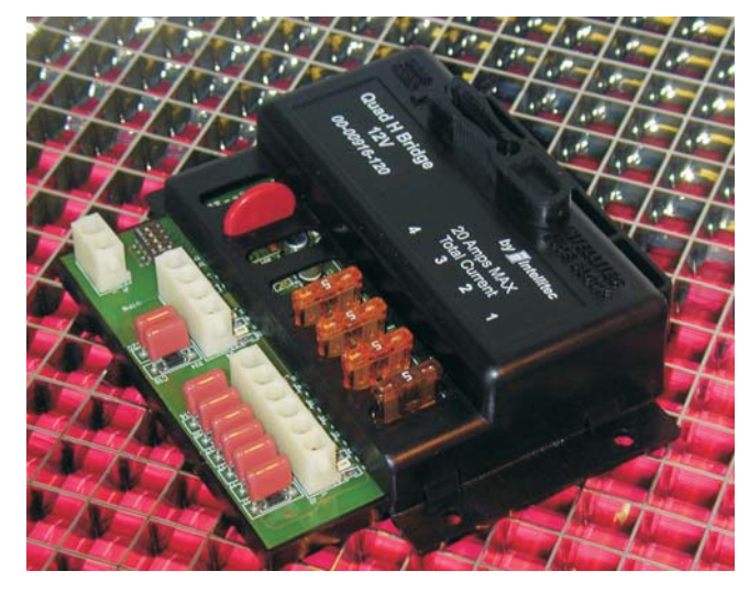
PAT NO. 4,907,222 & 6,011,997

Each of the outputs can also be used as individual outputs with the understanding that the load will be grounded when turned off. This allows the module to power up to 8 individual loads.