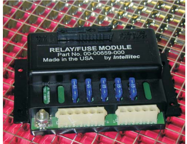
Part Number 00-00659-000

The relays used are rugged, automotive rated units that will provide long life under heavy use.