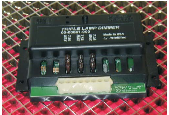
Part Number 00-00661-000

Each of the three outputs is fused separately to protect them from inadvertent shorts. Connections are made to the module through an AMP Mate-N-Lok connector on the module.