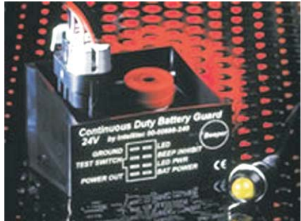
Part Number 00-00698-000

If the voltage remains below the threshold for an additional two minutes, the unit will turn off power to the solenoid, preventing the further use of the electro-hydraulic motor pump. Starting the vehicle, raising the battery voltage to the normal charging voltage, can then reset the unit.