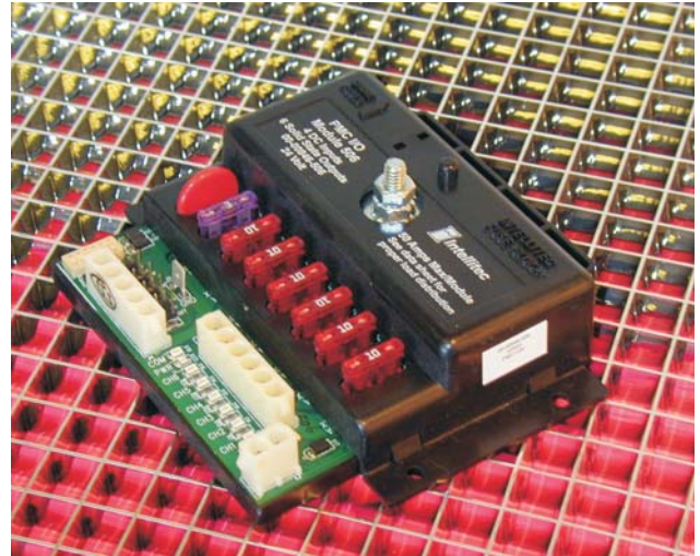
Dimensions 5-3/4 X 5 inches Pat. No. 4,907,222 & 6,011,997

This module should be installed in a protected environment, inside a vehicle.