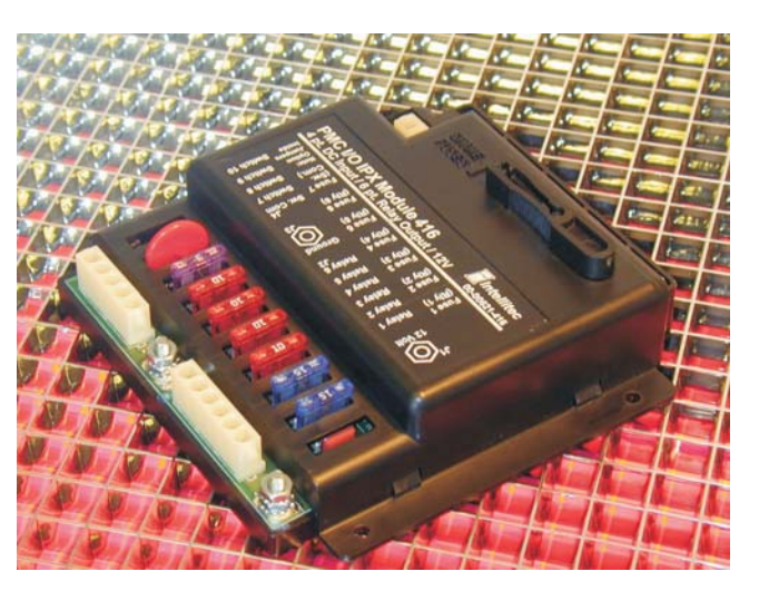
PAT NO. 4,907,222 & 6,011,997

The approximate module dimensions are 6.375" X 6.250" X 1.875" (16.2mm X 15.9mm X 4.8mm). It should be installed in a protected environment, inside the vehicle.